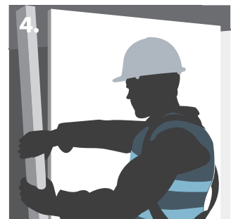
4. Positioning Knauf 'C-T' Stud to lock Knauf Core Board into place.