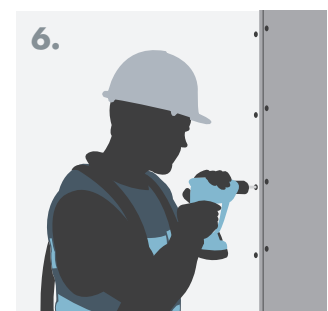
6. Fixing Knauf Fire Panel.