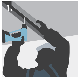
1. Fixing Knauf 'J' Channel to the soffit.

When constructing a firefighting lift shaft, Knauf Performance Plus is used, as it is highly durable and able to withstand the effects of impact and water, to which it would be subjected during a fire, without losing its fire resistance or integrity when tested to BS 9999: 2008. This means that fire crews maintain protected access to all floors within the building.