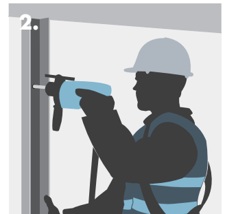
2. Fixing Knauf 'J' Channel to the abutting wall.