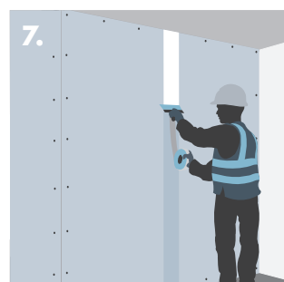
7. Fixing Knauf Fire Panel.