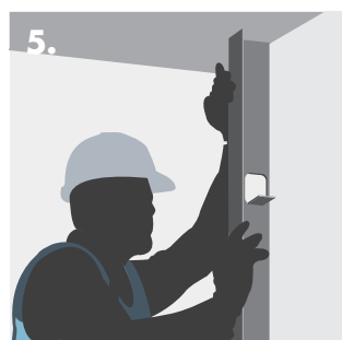
5. Knauf 'J' Channels are used vertically at corners and abutments.